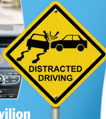
Distracted Driving Pavilion