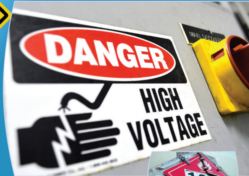
High Risk Pavilion